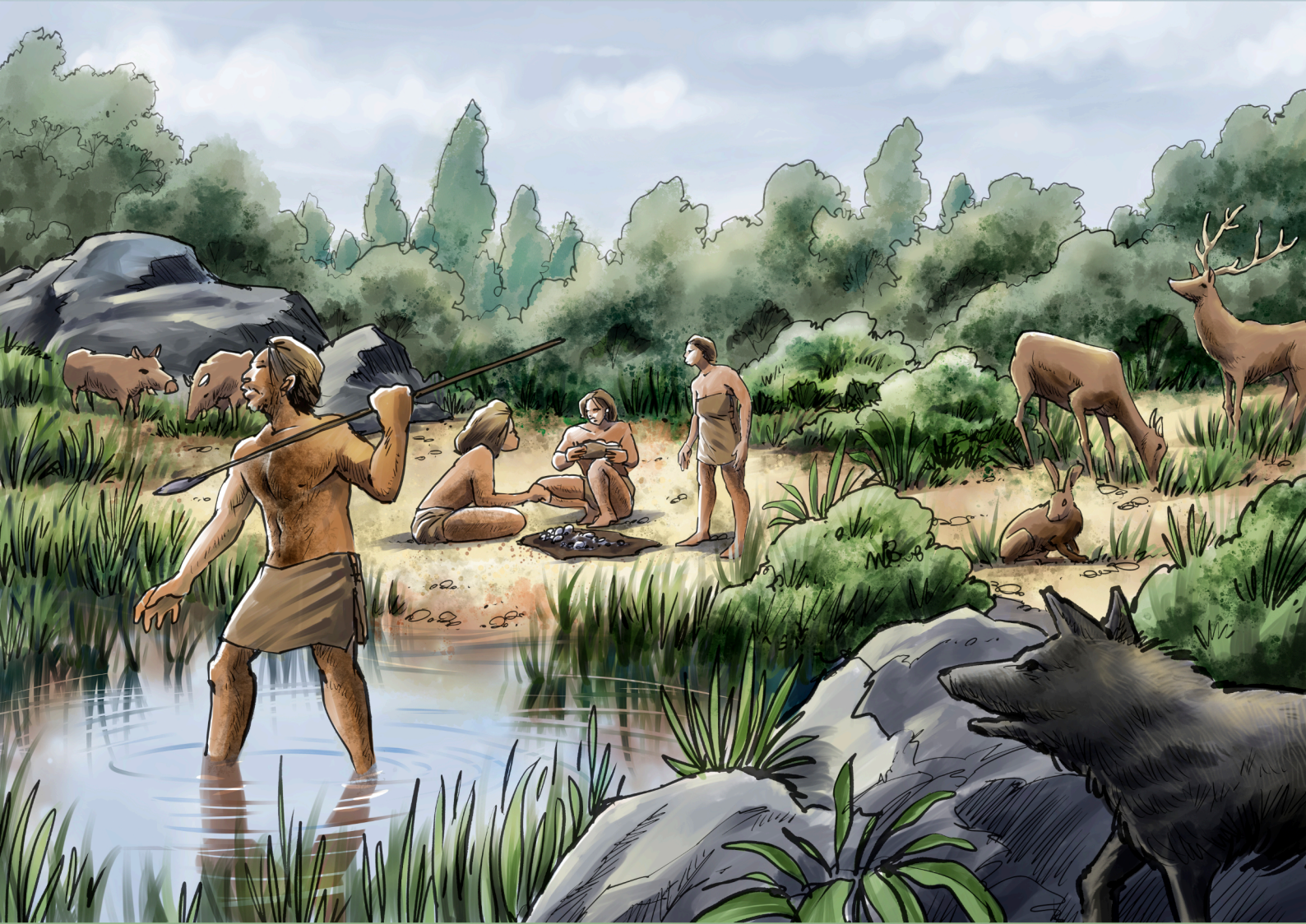
Illustration: Pedro Loureiro

66 th CONFERENCE OF THE HUGO OBERMAIER SOCIETY April 22 nd to 26 th , 2025, Faro HYBRID CONFERENCE